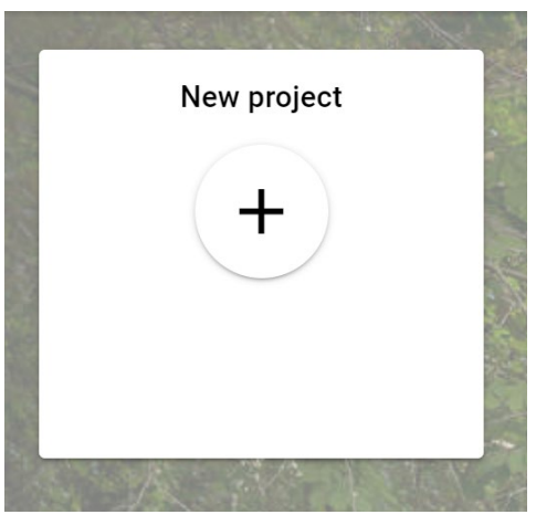
(Figure 1): Create new project